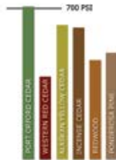
CRUSHING STRENGTH (PARALLEL TO GRAIN)

Maximum crushing strength in pounds per square inch.