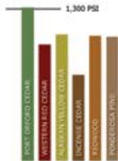
SHEARING STRENGTH (PARALLEL TO GRAIN)

Fiber stress at proportional limit in pounds per square inch.