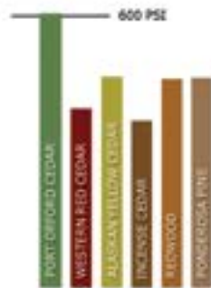
SIDE HARDNESS (PERPENDICULAR TO GRAIN)

Maximum shearing strength in pounds per square inch.